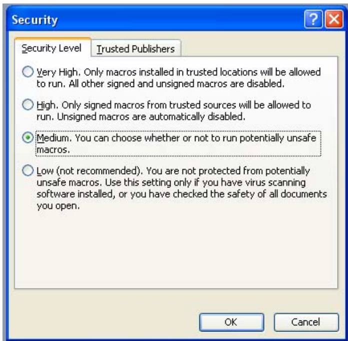
Fig. 2. Select the 'Medium' Security Level.